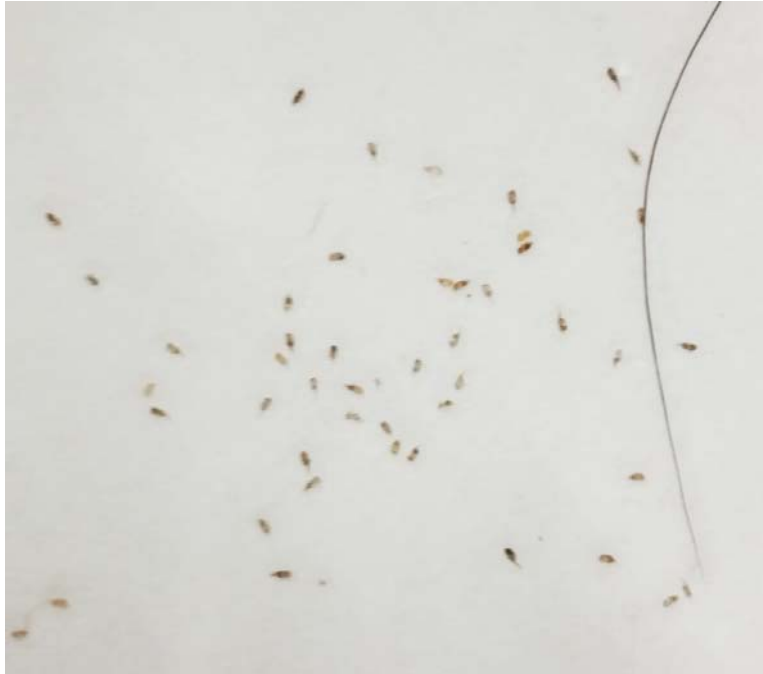
Lice Eggs On Paper Towel (Magnified)